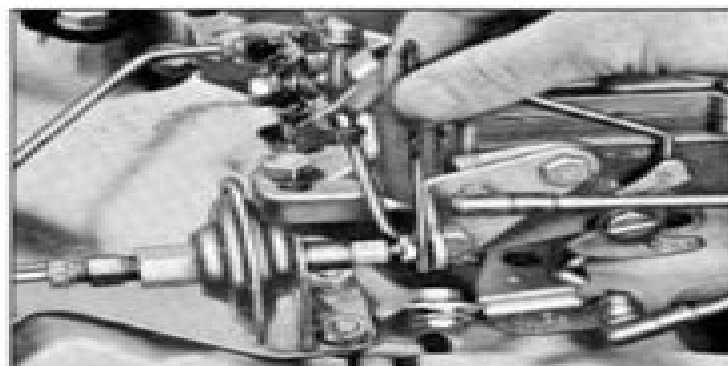
Fig. 6B-2 Using Drill to Measure Throttle Return Check Setting

is set according to specifications. If for any reason the fast idle speed is changed, recheck the throttle return check adjustment.