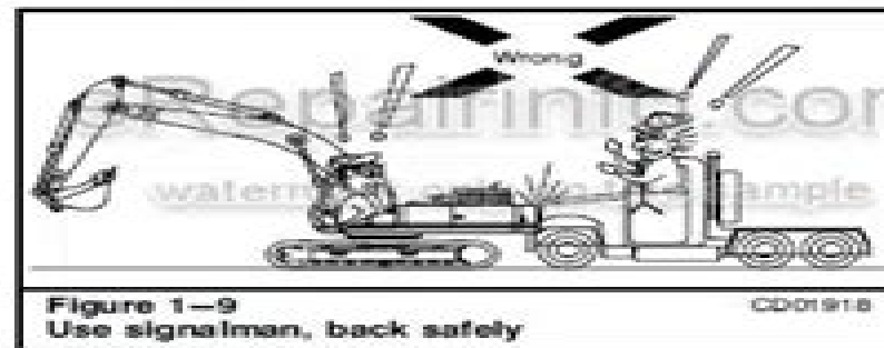
Figure 1-9 Use signalman, back safety