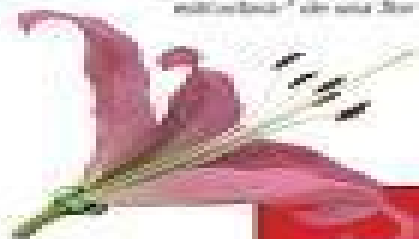
structure of a flower estructura f de una flor f