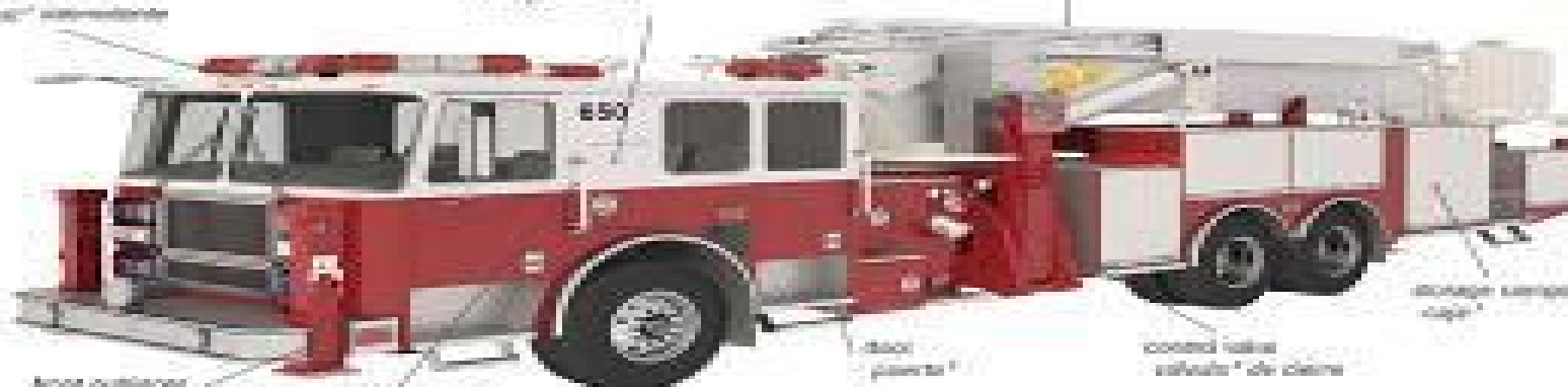
front outboard espejo m frontal