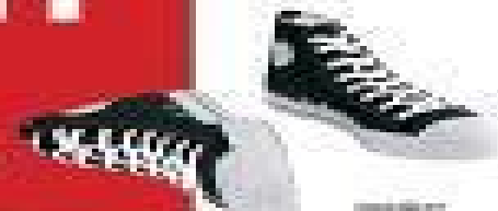
sneaker zapato m deportivo