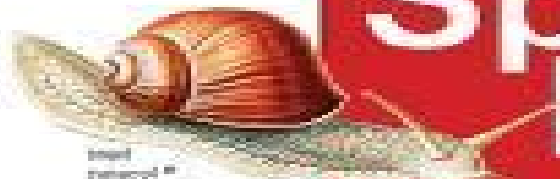
snail caracol m