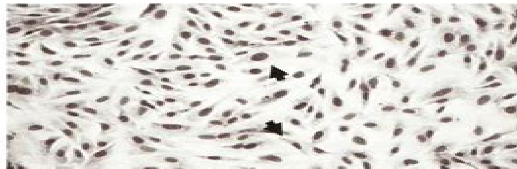
Figure 2-1. Low-power micrograph of a monolayer of normal bovine fetal spleen cells. Contact inhibition results in the formation of a monolayer of stellate- and spindle-shaped cells (arrows). ( \times 40 , Giemsa stain.)

Cell culture permits direct observation of living cells. It is routine because of the use of antibiotics. Cell culture also allows the continual observation, manipulation, and testing of explanted cells without donor jeopardy (Figs. 2-1 and 2-2). It facilitates studying cell differentiation, cell transformations, cytogenetics, cellular metabolism, cell-to-cell interactions, host-parasite relationships, and other biological processes. Cell culture is indispensable in diagnostic virology (Figs. 2-3 and 2-4), vaccine development, and vaccine production.