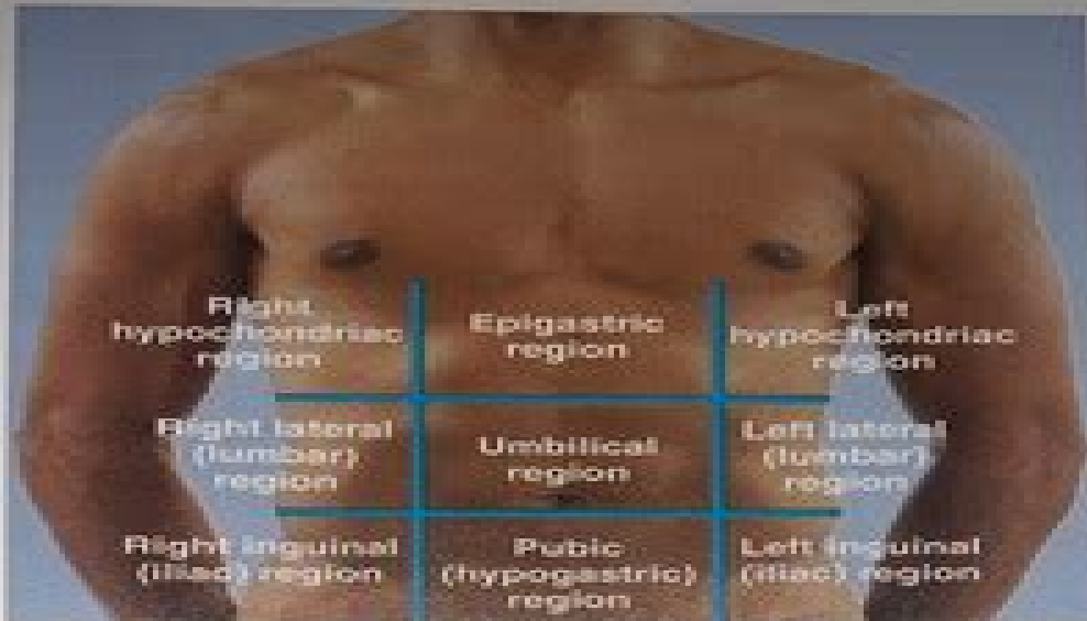
(a) Nine regions delineated by four planes