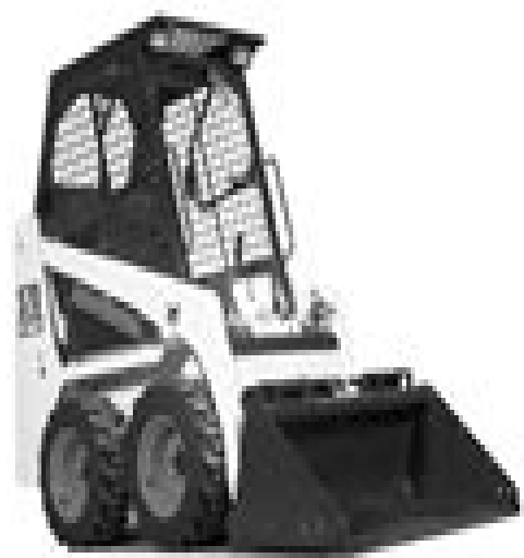
Operator Display - View for Monitors