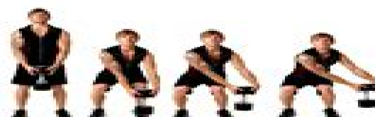
08. side deadlift combination. Light to light deadlift, side muscles. Light to moderate weight.