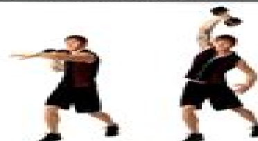
06. split stance obliques press. One arm oblique press, other hand on hip. Light to moderate weight.