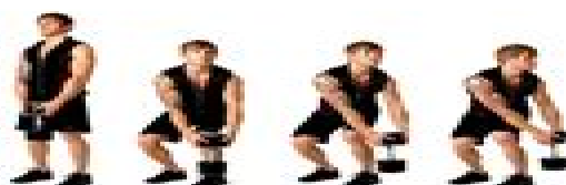
05. rotational deadlift combination. Rotational deadlift, side muscles. Moderate weight.