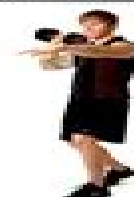
10. rotating core press. One arm oblique press, other hand on hip. Moderate to heavy - front and side.