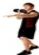
01. split stance press. One arm overhead press, other hand on hip. Moderate to heavy - front and side.