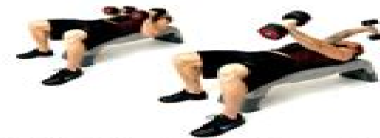
02. pull over/press chest combo. One arm pull over, other arm overhead press. Moderate to heavy - front and side.