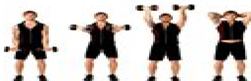
03. bicep to triceps big curl. Big forward to backward curl, front to back. Moderate to heavy - front.