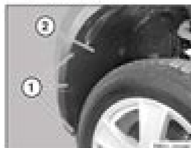
Fig. 23: Loosen Screws (1) On The Right And Left Of The Wheel Arch Corner (2)

Loosen screws (1) on the right and left of the wheel arch corner (2). Installation note: Make sure wheel arch corner (2) is in correct position.