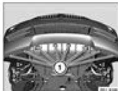
Fig. 22: Release Screws (1) Under Vehicle

Loosen screws (1) on the right and left of the wheel arch corner (2). Installation note: Make sure wheel arch corner (2) is in correct position.