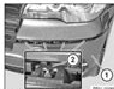
Fig. 25: Bumper Trim (1) Is Locked At Side In Fixture

Remove bumper trim (2) towards front with aid of a 2nd person.