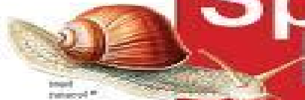
snail caracol m