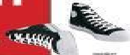
sneaker zapatilla f deportiva