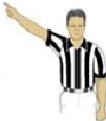
POINTS SCORED (1 OR 2 FINGERS)