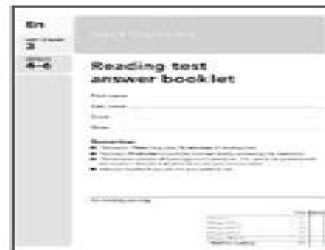
Reading test answer booklet