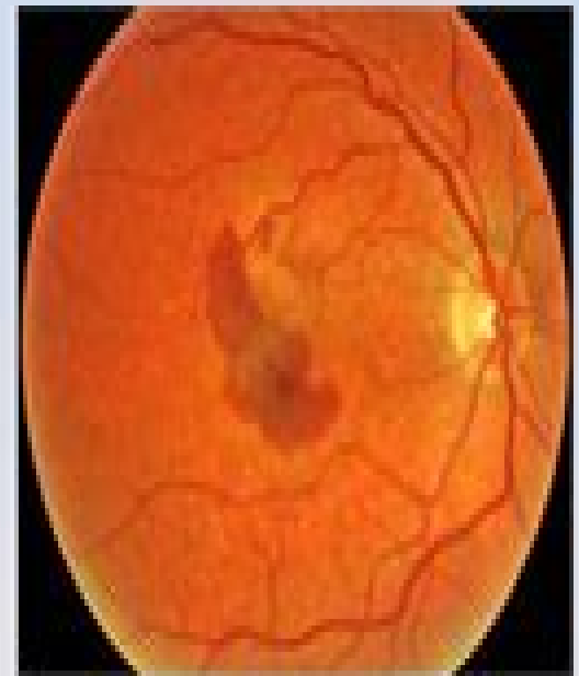
WET MACULAR DEGENERATION