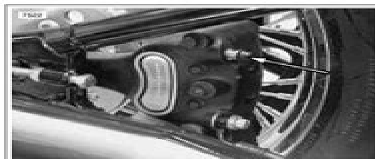
Figure 1-15. Rear Brake Bleeder Valve