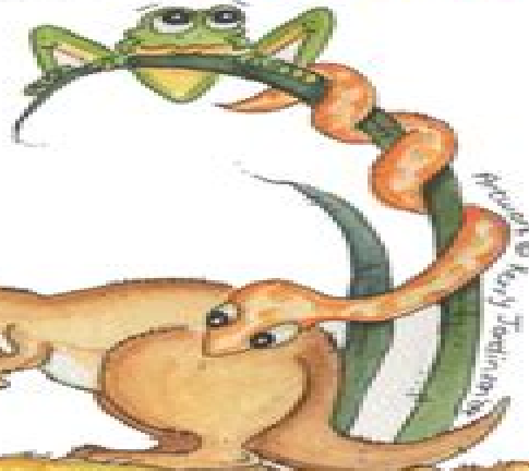
Illustration by Kerry Goodwin