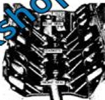
Further research is needed to establish the validity of the findings.

19. Disconnect the battery cable at the negative motor, unplug the battery cable from the positive terminal (PTC).