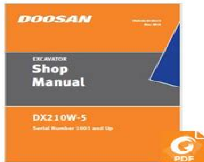
Doosan-DX210W-5-Excavator-S hop-Manual-950106-01052-E-1 .pdf