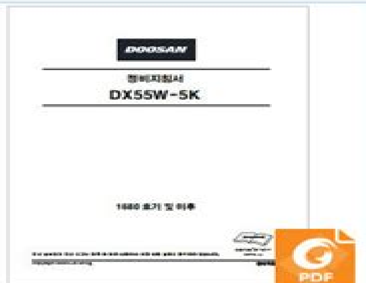
Doosan Wheel Excavator DX55W-5K Shop Manual_KR.pdf