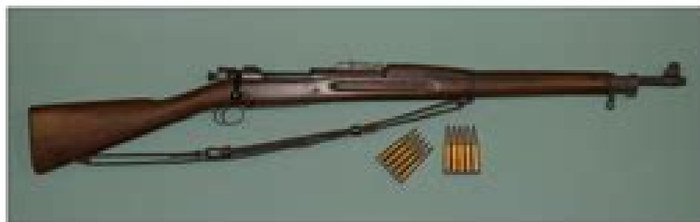
Springfield M1903 Rifle