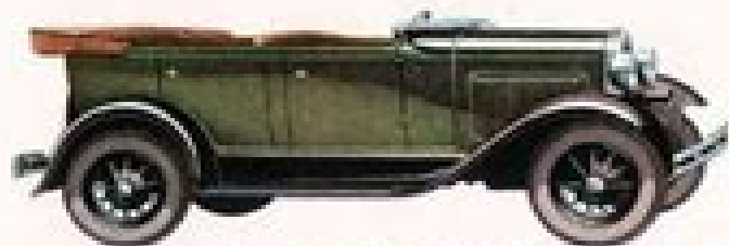
NEW FORD PHAETON

Another example of Ford values—with low, fleet lines, beautiful colors, and outstanding performance. The substantial top is easy to put up or take down. Gleaming stainless steel is used for many exterior metal parts.