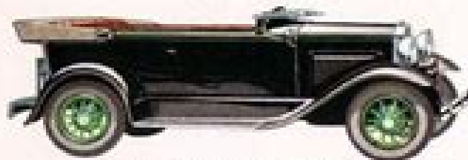
NEW FORD DELUXE PHAETON

Combines the roadster's joy freedom and the snug comfort of a coupe. The convertible top may be easily raised or lowered. The adjustable seat is upholstered with rich tan Bedford cloth. Equipped with rubber seat.