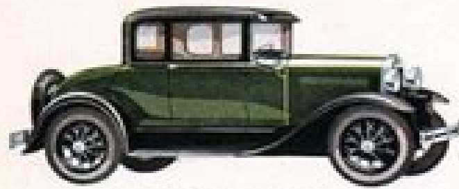
NEW FORD DELUXE COUPE

Truly Deluxe in line, color and appointments. Driver's seat is adjustable. Rear seat has folding center arm and side arm rests. Mohair or Bedford Cord upholstery of lovely, lasting texture is optional.