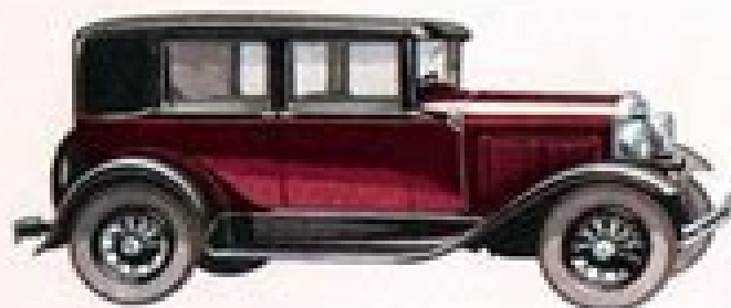
NEW FORD DELUXE SEDAN

Sweeping lines and attractive sport treatment. Seat and back cushions upholstered in genuine leather. One wide door admits to front and rear seats. Adjustable driver's seat. Bender well for spare wheel on left.