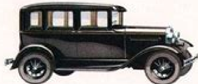
NEW FORDOR SEDAN

Another example of Ford values—with low, fleet lines, beautiful colors, and outstanding performance. The substantial top is easy to put up or take down. Gleaming stainless steel is used for many exterior metal parts.