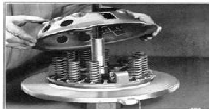
Fig. 64—Assembling Springs

Notes—Models C-18 and C-20 have 12 springs and 4 release levers