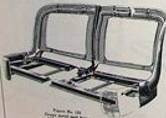
Figure No. 125 Section front seat metal rail frame and bolting seat back.