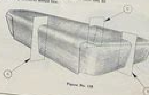
Figure No. 128

For a complete description of the construction of the front seat cushion, see the "A" closed seam body type.