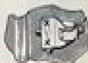
Figure No. 124 Bolt and washer in a seat construction of seat back.