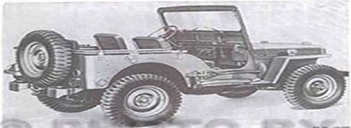
Figure 2. Section 2 of 2 military truck M20—high canvas-covered cargo area.