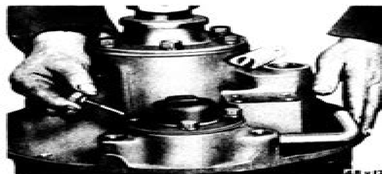
Fig. 47—Removing Shift Fork Cover

(When reassembling hold adjuster and bearing cap up away from threads in bore of carrier until cap bolts are started. Drop