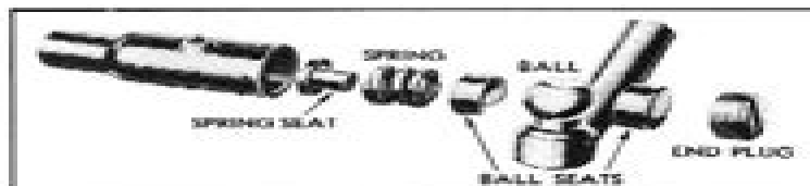
Fig. 3—Front Axle Tie Rod

Two types of tie rod ends are used. Figure 3 illustrates the adjustable type used on all \frac{1}{2} and \frac{3}{4} ton except the \frac{3}{4} ton Forward Control. The